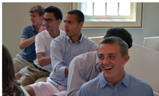
Watching the Chamber Singers at High Point University.