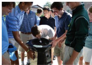
Hoping for straight A's after sipping from the Old Well at UNC.