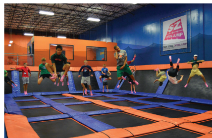
Break time = Trampoline time.