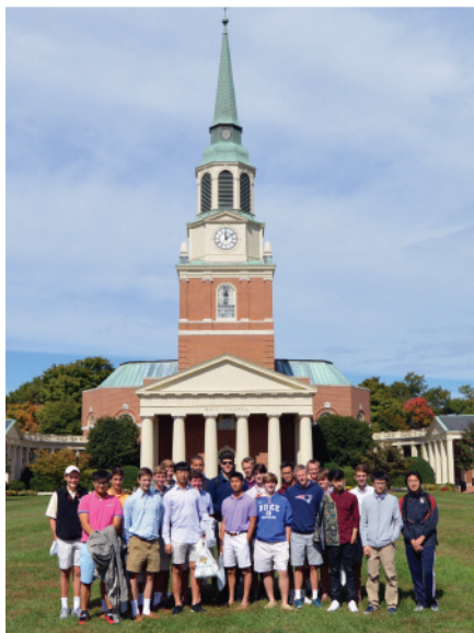
Stopping to pose in front of Wait Chapel at Wake Forest.